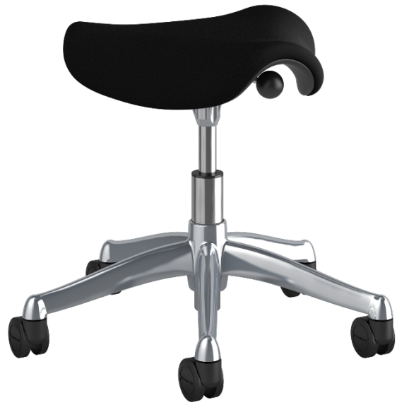
Freedom® Pony Saddle